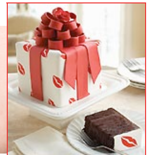
Perfect Endings Sweet Kisses All Over $89.99